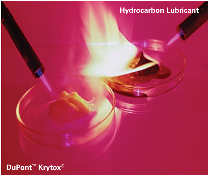
Hydrocarbon-based lubricants burn; Krytox® does not.