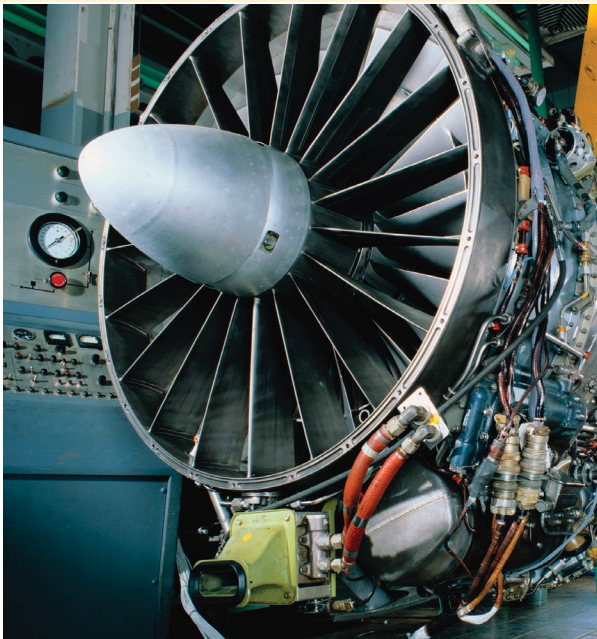
XHT Grades: Extreme Conditions, Extreme Performance