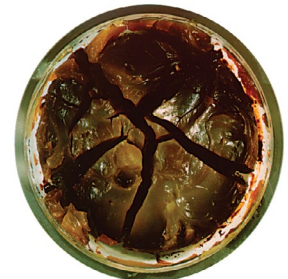
In oven at 232 °C (448 °F) for 40 hr: Hydrocarbon—40% wt loss