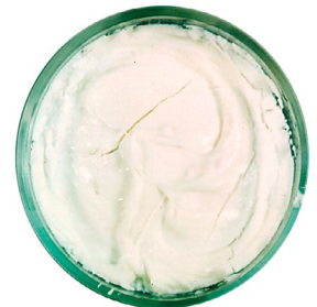
In oven at 232 °C (448 °F) for 40 hr: Krytox®—0% wt loss

Krytox® lubricants are more effective at even higher temperatures, regardless of operating duration. Using base oils, thickeners, and additives with chemistry designed to create high and low viscosity, these products are targeted for use solely in the very high-temperature range. Available in several grades that offer anticorrosion, extra bonding, and non-melting properties, these lubricants have applications in a variety of industries, including chemical, textile, tire, aviation, conveyor, glass, plastic film, non-woven manufacturing, and mining and metal processing.