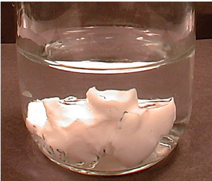
Krytox® grease in hydrocarbon solvent is not dissolved.